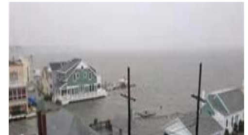
Ocean City, MD Hurricane Sandy (2012)