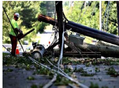
Severe Storms & Straight-Line Winds (2012)