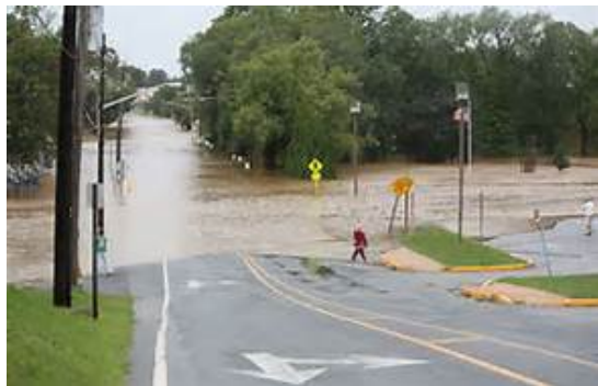
Hurricane Irene (2011) Elkton, MD

Following a Presidential declaration MEMA conducts an Applicants' Briefing to provide details about the program. Applicants may then submit a Request for Public Assistance. If approved, applicants are contacted by a FEMA representative to formulate and process their Public Assistance Program project claims. FEMA approves the projects and obligates funds to the State, who in turn provides those funds to the applicant. After all eligible work is complete and funds provided to the applicant, the State closes the projects and the applicant with FEMA.